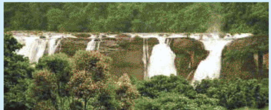
Athirappilly Water Falls

Kerala Backwaters : Backwaters in Kerala are inter-connected freshwater rivers and canals that feed towards the sea. It is a network of channels, lakes, lagoons and deltas of approximately 44 rivers emptying in the Arabian sea. The principal mode of transport on these backwaters is houseboats. A vast network of backwaters in Alappuzha, Kollam, Kottayam, and Ernakulam districts makes Kerala the Venice of East.